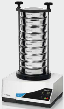
The vibratory sieve shaker AS 200 basic is suitable for separating metal powders into size fractions