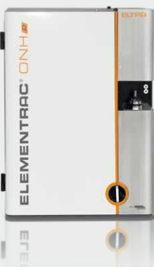
Oxygen / Nitrogen / Hydrogen Analyzer ELEMENTRAC ONH-p 2

A big advantage of DIA is the possibility to simultaneously measure particle size and particle shape (percentage of round/irregular particles, satellites, agglomerates, etc.). Even smallest percentages ( \sim 0.01\% ) of oversized or undersized grains or irregular particles are detected by the system within 1 to 3 minutes which allows for continuous quality control.