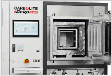
View into the furnace chamber of the HTK vacuum furnace