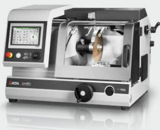
Cutt-off machine Qcut 200 A