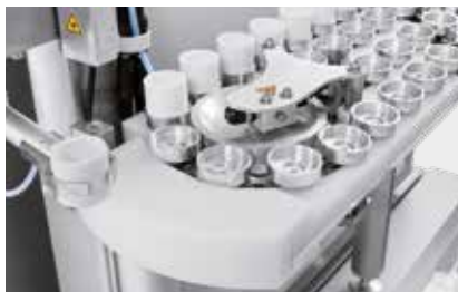
Placement on the autoloader and analysis