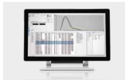
Measurement results and export