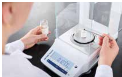
Logging the sample into the software and weighing

Operation of the C(H)S 580 A is simple, fast and convenient. The samples are weighed and registered in the software as manual analysis or analysis via autosampler. Typical sample weights are between 50 and 500 mg. After starting the analysis, the sample is introduced into the furnace and the combustion gases \text{CO}_2 , \text{H}_2\text{O} and \text{SO}_2 are measured in up to four infrared measuring cells. The measurement results can be exported via LIMS, report or text file.